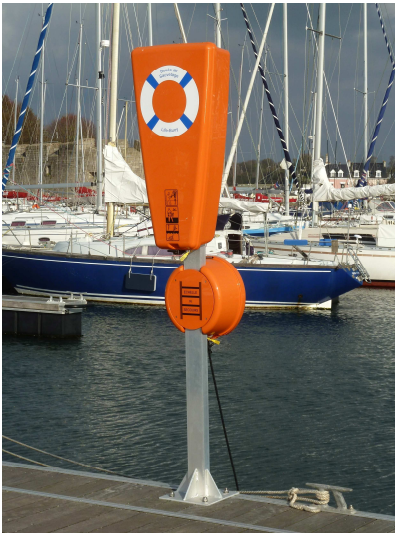
Pontoon Ladder + Life-buoy Silzig®

Ladder can be associated with the buoy, and also a fire extinguisher box This set of equipments is a real safety point, clearly visible and reconizable by far