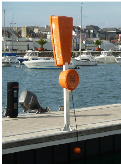
Pontoon ladder + fire extinguisher box