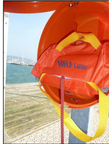
Ladder in its box